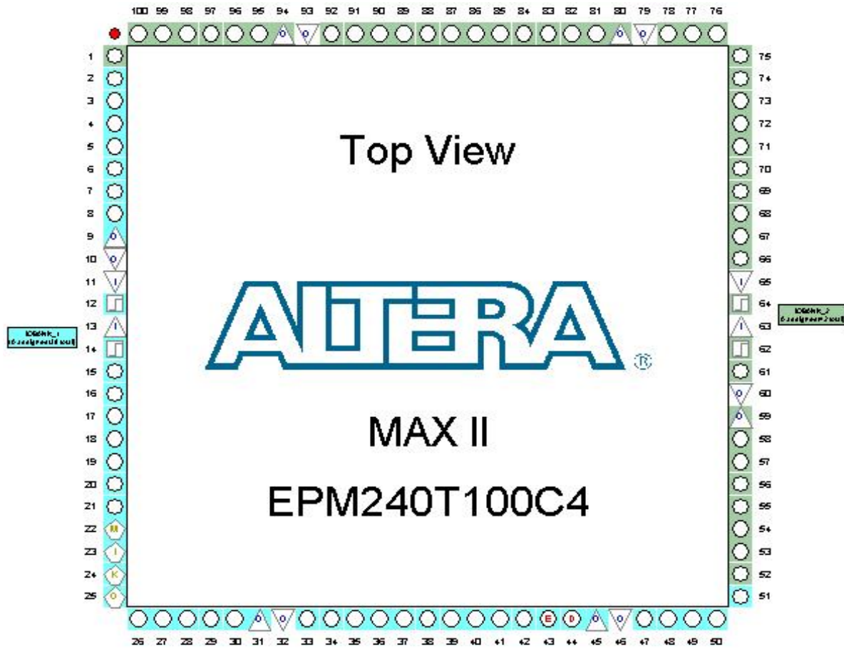
Figure 1. MAX II EPM240 / EPM240G T100 Device Top View Package Diagram and Bank Information